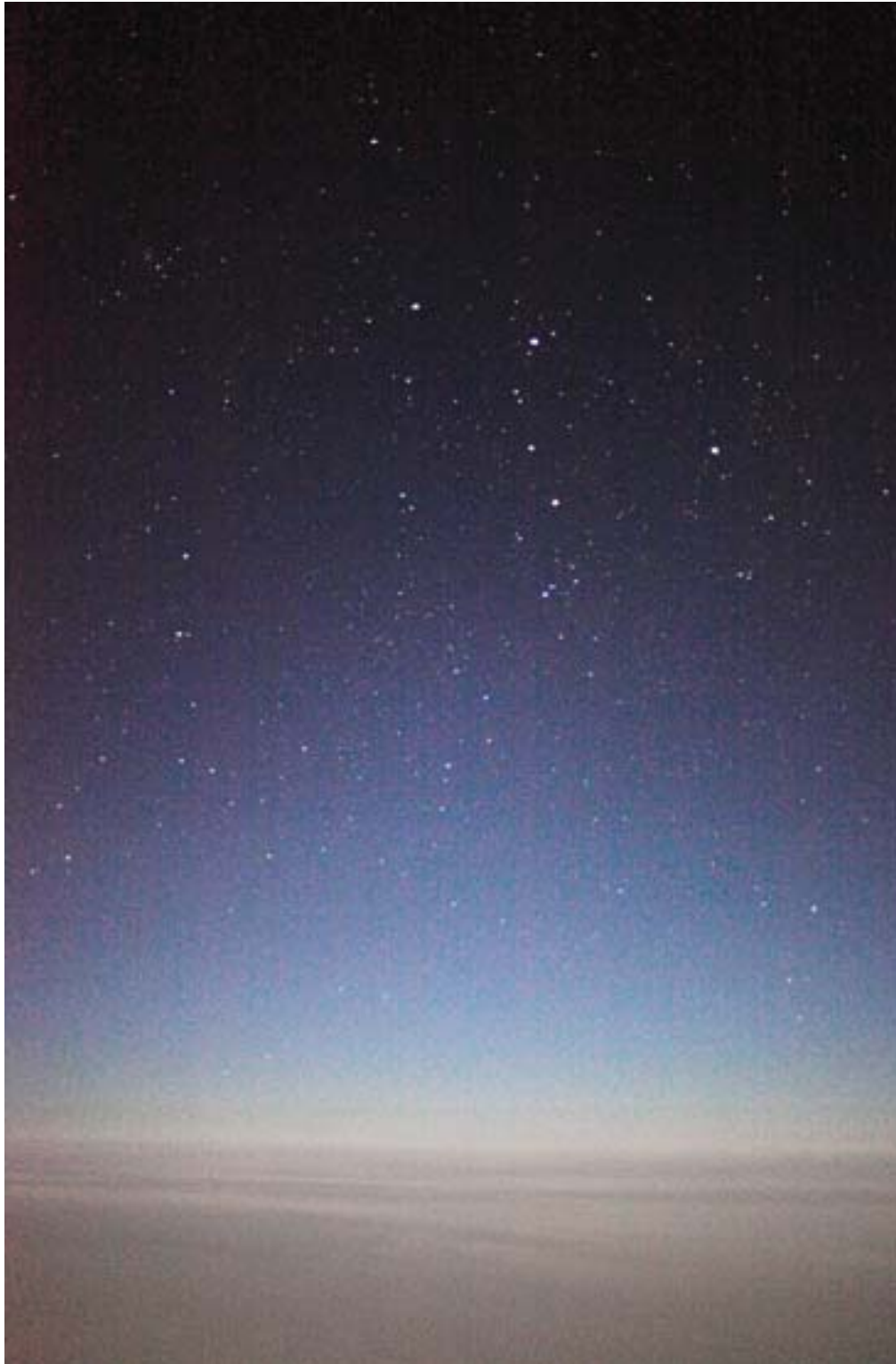
Wolfgang Tillmans in flight astro (ii) 2010 Inkjet print 207.5 x 138 cm