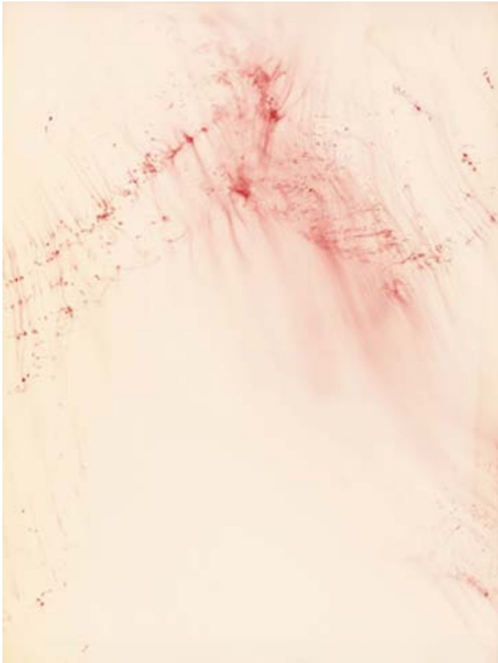
Wolfgang Tillmans Urgency XXII 2006 Framed C-type print 238 × 181 cm