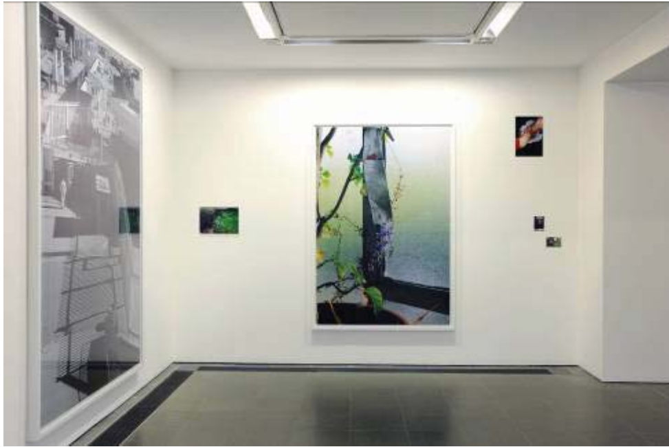
Wolfgang Tillmans Installation view Serpentine Gallery 2010