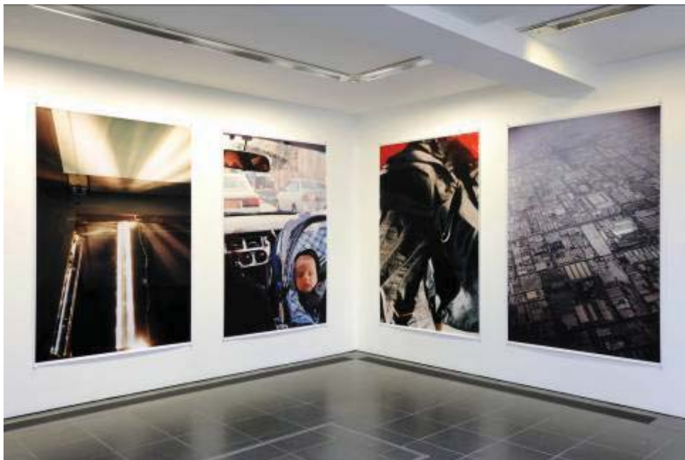
Wolfgang Tillmans Installation view Serpentine Gallery, Photograph by Gautier de Blonde 2010