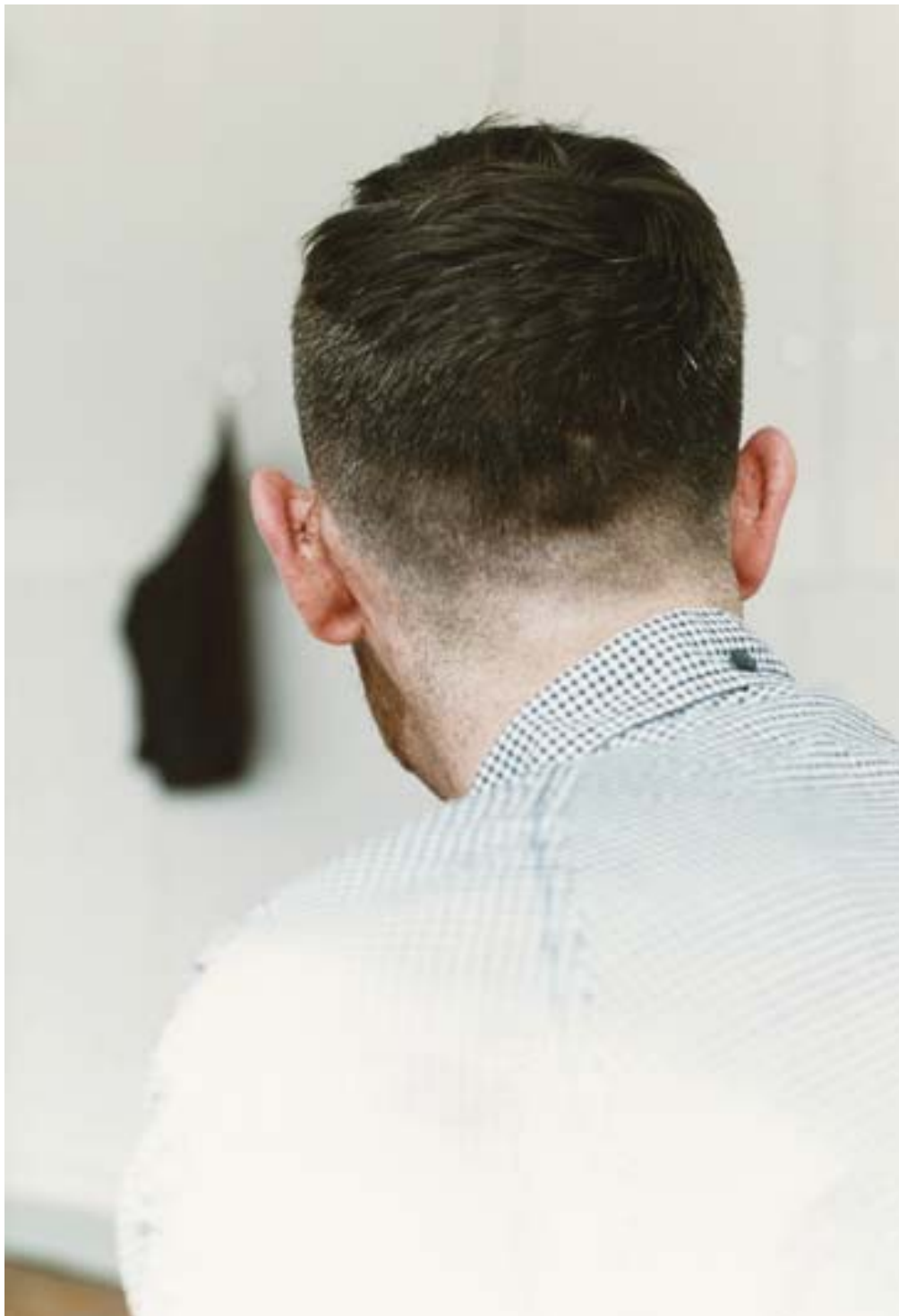
Wolfgang Tillmans haircut 2007 C-type print 40.6 x 30.5 cm