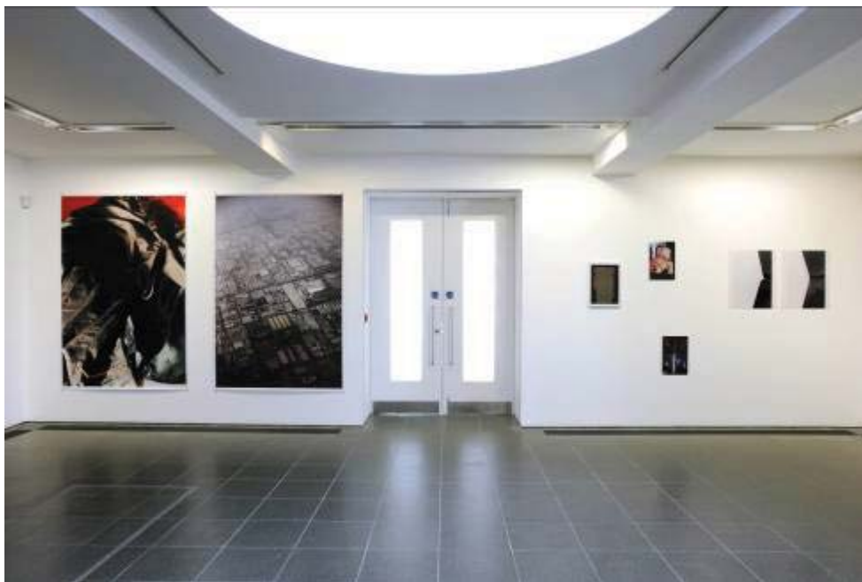
Wolfgang Tillmans Installation view Serpentine Gallery 2010