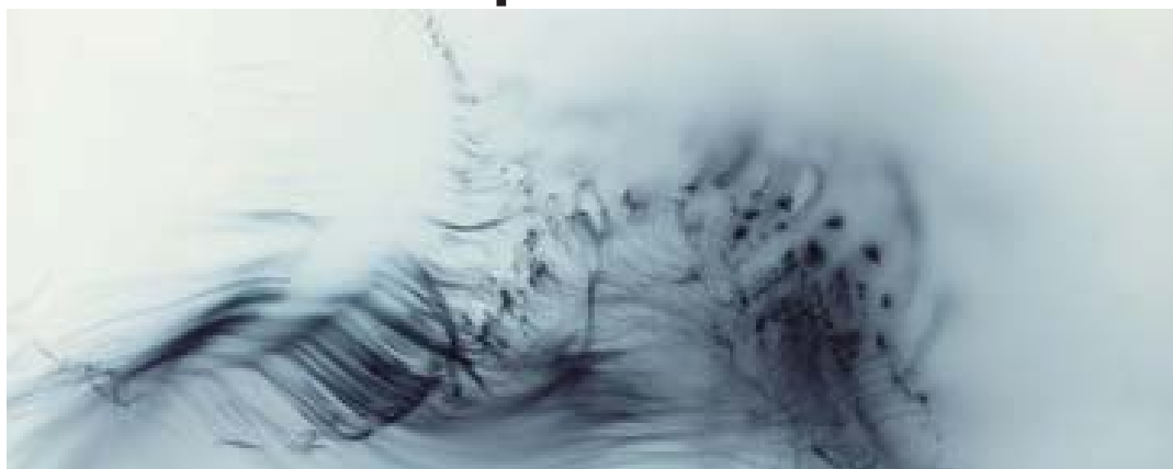
Wolfgang Tillmans Ostgut Freischwimmer, right 2004 Inkjet print 231.1 × 607.8 cm Collection of Kunstmuseum Basel