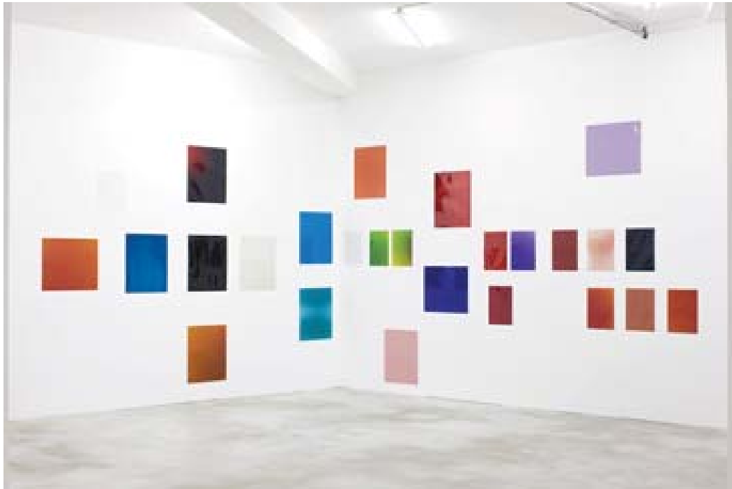
Wolfgang Tillmans Silver Installation VII 2009 Unique C-type prints 306 × 843 cm