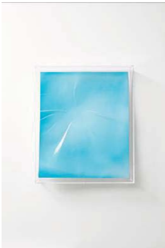
Wolfgang Tillmans Lighter, blue concave I 2008 Unique C-type print in Plexiglass hood 64 × 54 × 12.5 cm