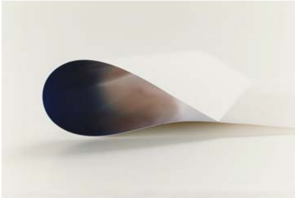
Wolfgang Tillmans paper drop (Roma) 2007 C-type print 145 x 212 cm