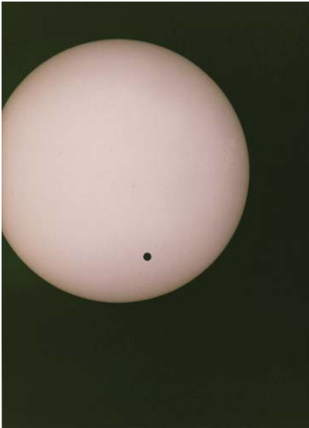
Wolfgang Tillmans Venus, transit 2004 C-type print 40.6 × 30.5 cm