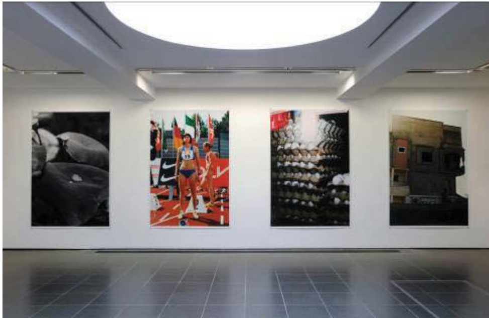
Wolfgang Tillmans Installation view Serpentine Gallery, Photograph by Gautier de Blonde 2010